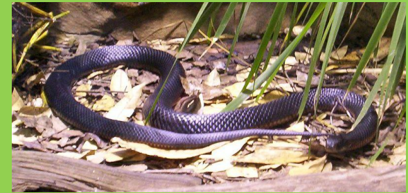
Red-bellied black snake

Some of the most common snakes found in NSW include the Red-bellied black snake (pictured above) and the Eastern brown snake (pictured below). Other species also inhabit areas of NSW.