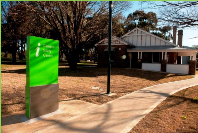
UNE Campus Safety Centre (B089), Elm Avenue, Armidale (please refer to map contained within this guide for location directions)

Whilst at UNE's wide network of Campuses and Study Centres you may possibly encounter a native or domestic animal that requires a degree of caution.