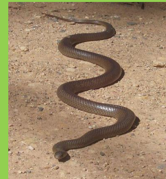
Eastern brown snake

Some of the most common snakes found in NSW include the Red-bellied black snake (pictured above) and the Eastern brown snake (pictured below). Other species also inhabit areas of NSW.